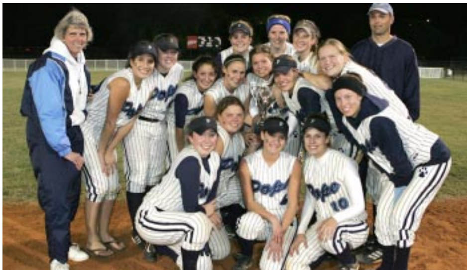
Slow Pitch Pope Lady Greyhounds

Photos of the championship softball teams were provided by Photographic Arts . Other photos taken at the State Tournament can be found at schoolpix.biz .