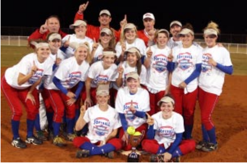
Class AA North Oconee Lady Titans