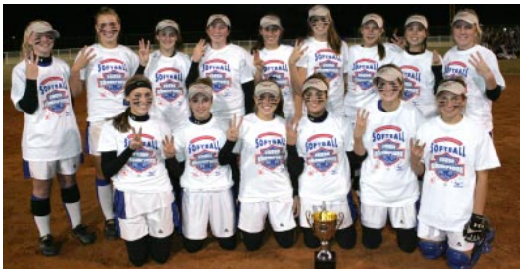
Class AAA Oconee County Lady Warriors