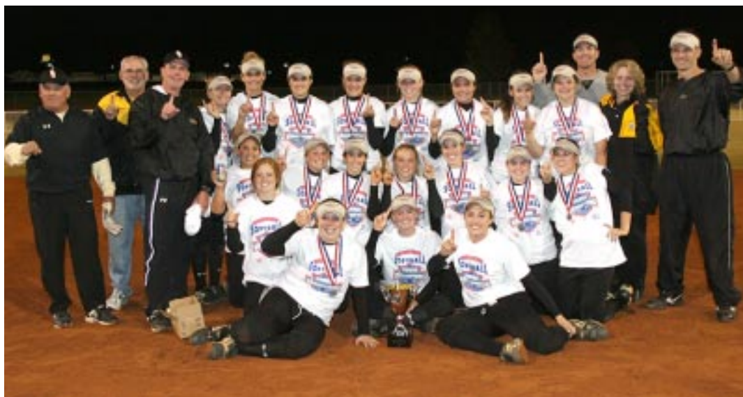
Class AAAA Sequoyah Lady Chiefs