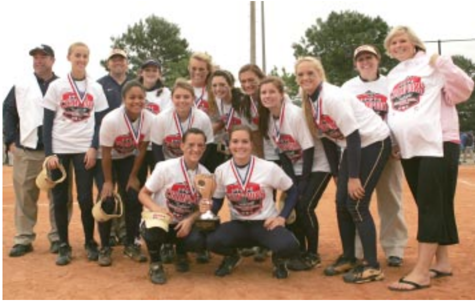
<u>Class A</u> Eagle's Landing Christian Academy Lady Chargers