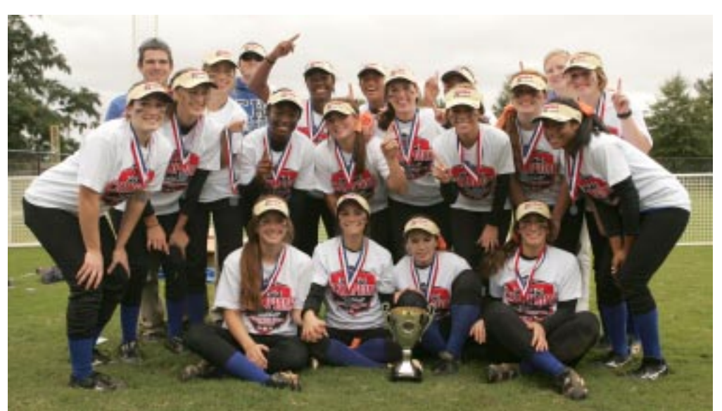
<u>Class AAA</u> Columbus Lady Blue Devils