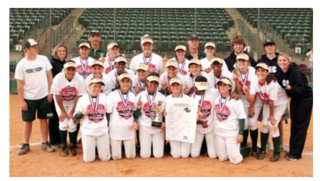
Class AAAAA Collins Hill Lady Eagles