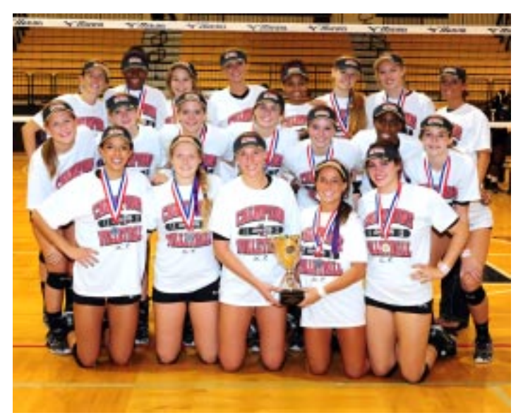
Class AAAAA: Walton Lady Raiders