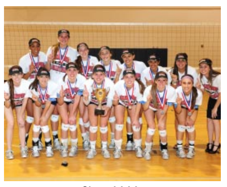
Class AAAA: Pope Lady Greyhounds