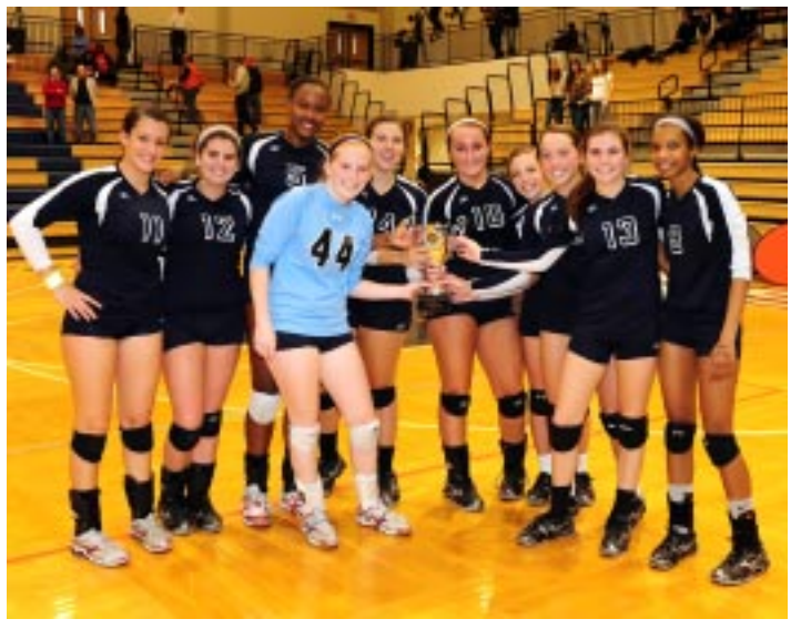
Class AA/A: Eagles Landing Christian Lady Chargers