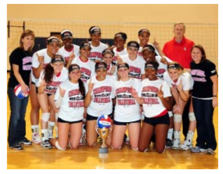
Class AAA: Sandy Creek Lady Patriots