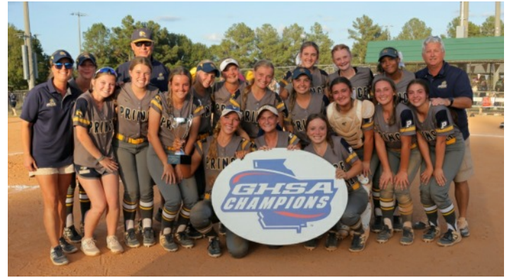
A, Division 1: Prince Avenue