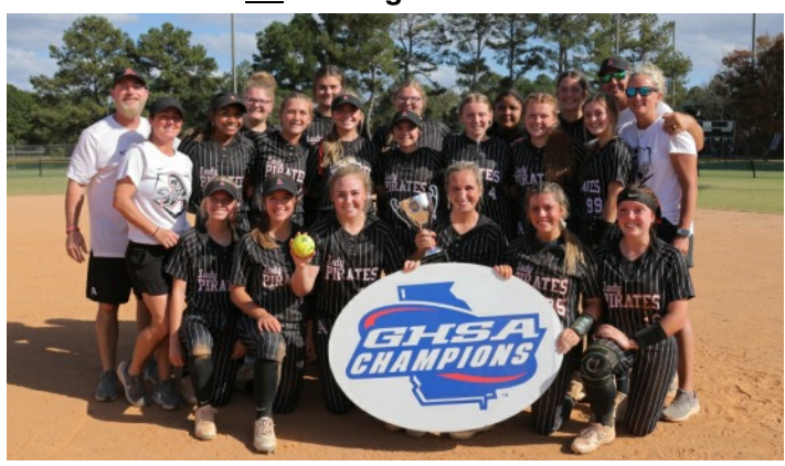
2A: Appling County