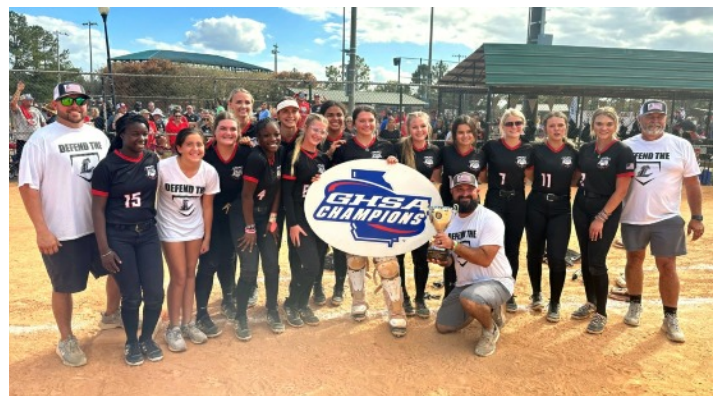
A, Division 2: Lanier County