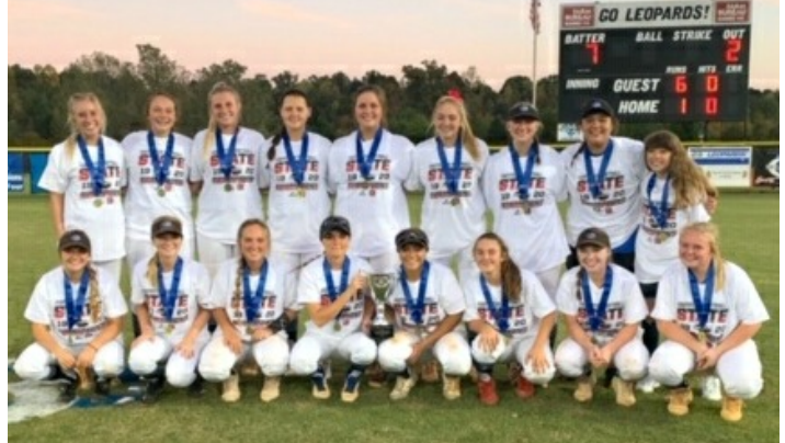
2A: Banks County