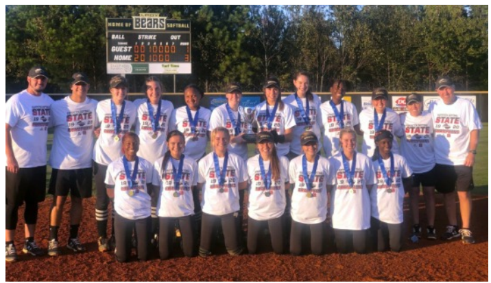
7A: Mountain View