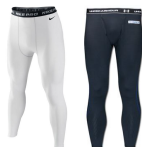
ILLEGAL Uniform Bottoms with decorative waistbands, multiple manufacturer logos, crotch outline