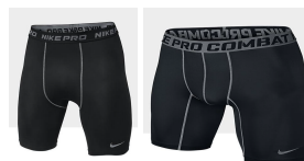
ILLEGAL Uniform Bottoms with decorative waistbands and crotch outline / opening