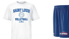
ILLEGAL These are NOT Track & Field uniforms.