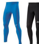
LEGAL Uniform Bottoms with single manufacturer logo, NO decorative waistband or crotch outline

NOTE: The ultimate responsibility to have each competitor compliant with jewelry and uniform rules is with the coach. Coaches should inspect any/all garments that competitors wear to ENSURE that they are in compliance with the GHS Missouri & NFHS Jewelry and Uniform Rules!!