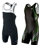
ILLEGAL One-piece Uniforms with multiple manufacturer logos / references.