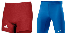
LEGAL Uniform Bottoms single manufacturer logo, no crotch outline or opening, no decorative waistband.