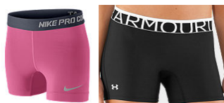
ILLEGAL Uniform Bottoms with decorative waistbands and multiple manufacturer logos / references.