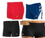
LEGAL "Closed-Leg" Women's Brief Uniform Bottoms