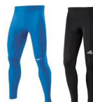
LEGAL Uniform Bottoms with single manufacturer logo, NO decorative waistband or crotch outline

NOTE: The ultimate responsibility to have each competitor compliant with jewelry and uniform rules is with the coach. Coaches should inspect any/all garments that competitors wear to ENSURE that they are in compliance with the GHS Missouri & NFHS Jewelry and Uniform Rules!!