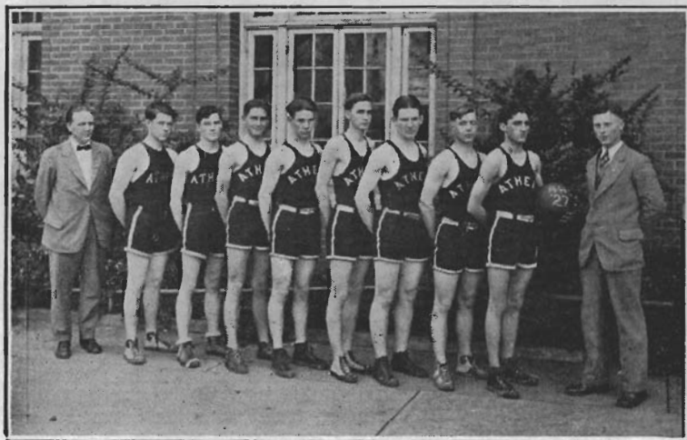
Athens Basketball Team, Runner-up in State Tournament, 1927.