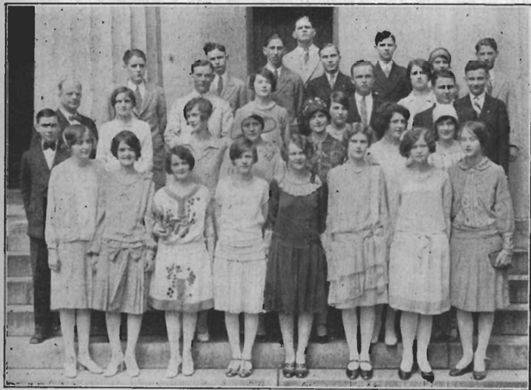
Group of Debaters, 1927.