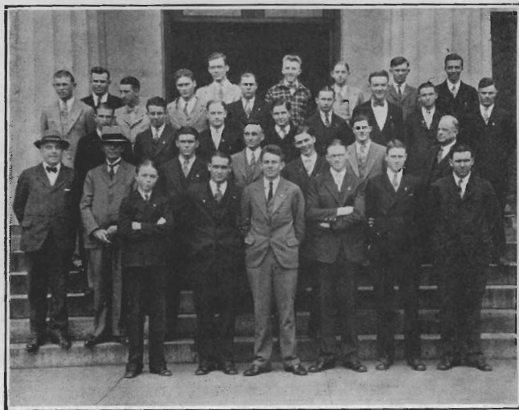
Group of Basketball Contestants and Officials, 1927.