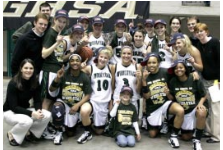
Class AA Girls Champion: Wesleyan