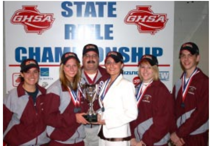
All Class Champion: Union Grove