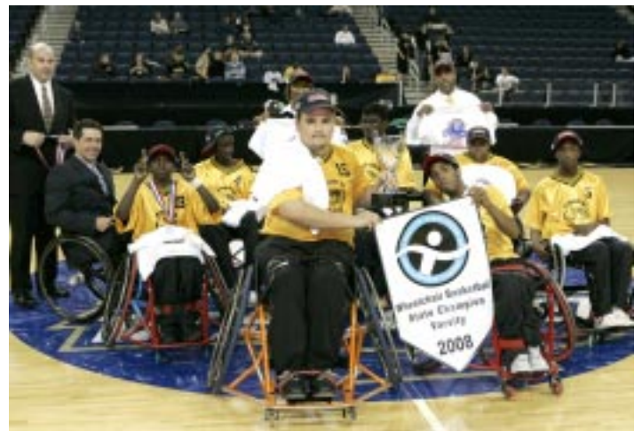
Wheelchair Champion: Atlanta Wolfpack