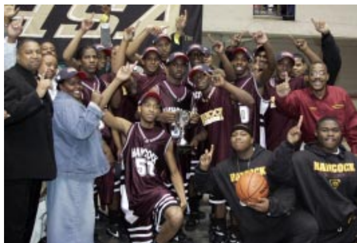
Class A Boys Champion: Hancock Central