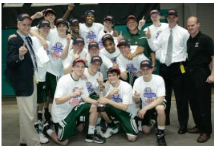
Class AA Boys Champion: Wesleyan

Photos of the 2008 Basketball state championship teams were provided by Photographic Arts. Additional photos may be found at www.schoolpix.biz .