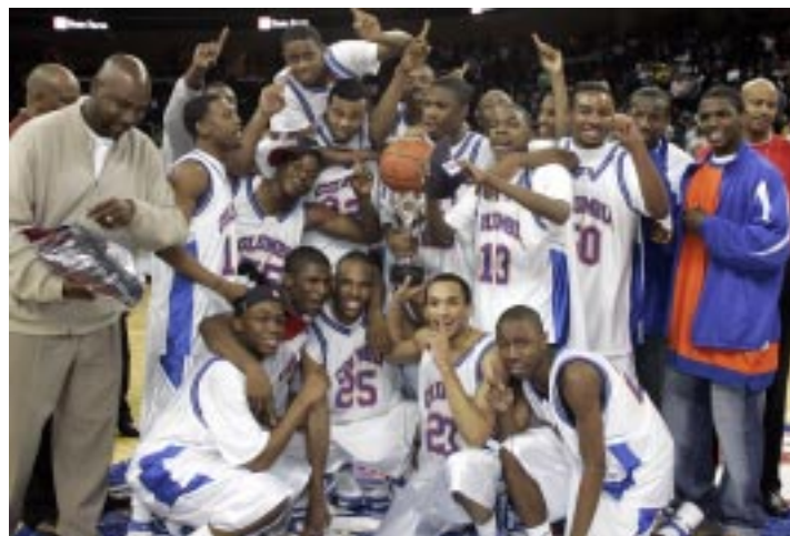
Class AAAA Boys Champion: Columbia