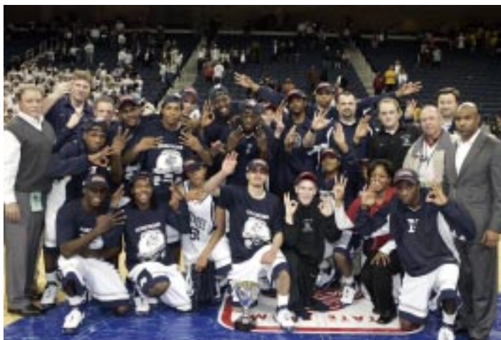
Class AAAA Boys Champion: Norcross