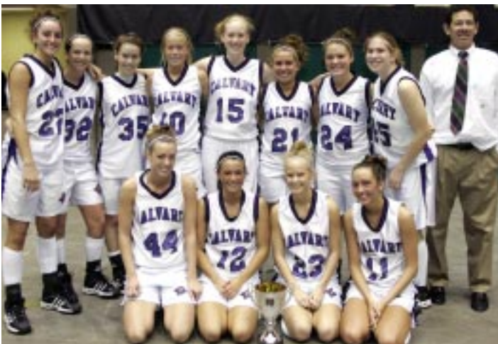
Class A Girls Champion: Calvary Day