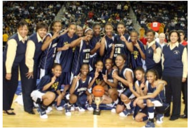
Class AAAA Girls Champion: SW DeKalb