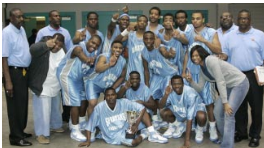
Class AAA Boys Champion: Glenn Hills