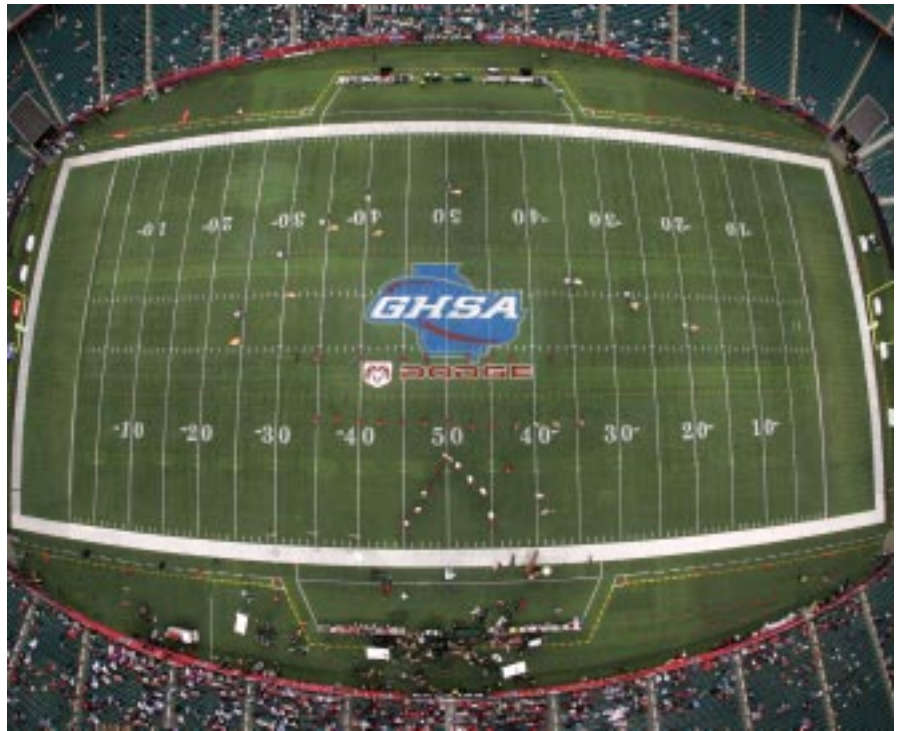
An overhead view of the Georgia Dome shows the Dodge logo at midfield.

The GHSA greatly appreciates the outstanding support of Dodge dealers throughout the state and encourages everyone to "Grab Life." For a full list of Dodge products go to www.dodge.com .