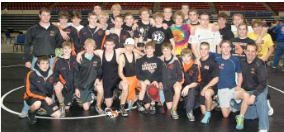
Class AA: LaFayette