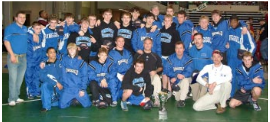
Class AAAA: Ringgold