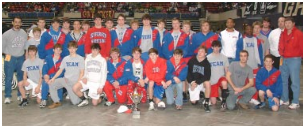
Class A: Jefferson