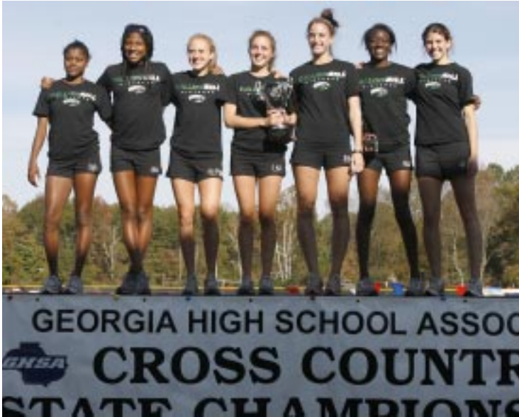
Class AAAAA Girls: Collins Hill