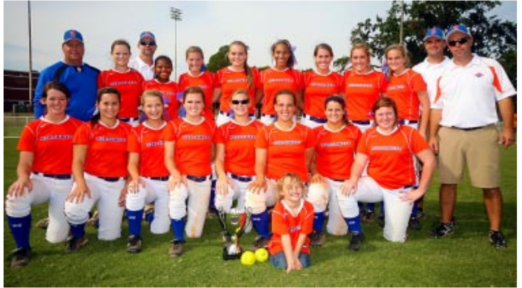
Class AAAA NW Whitfield Lady Bruins