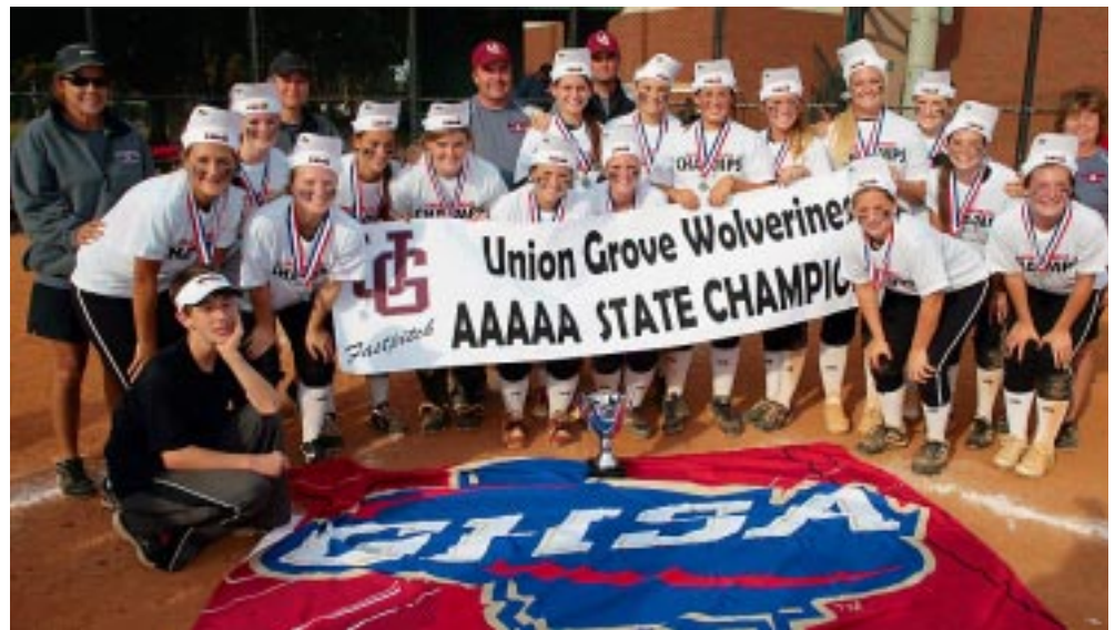
Class AAAAA Union Grove Lady Wolverines