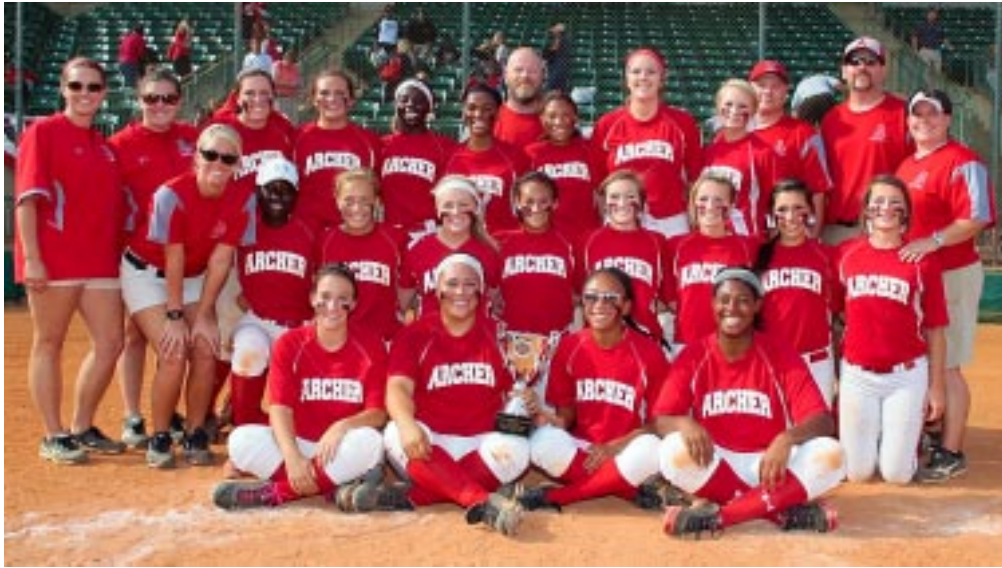
Class AAAAAA Archer Lady Tigers