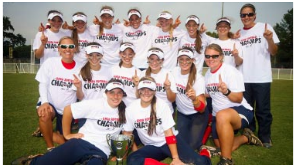
Class A Private Mt. Pisgah Lady Patriots