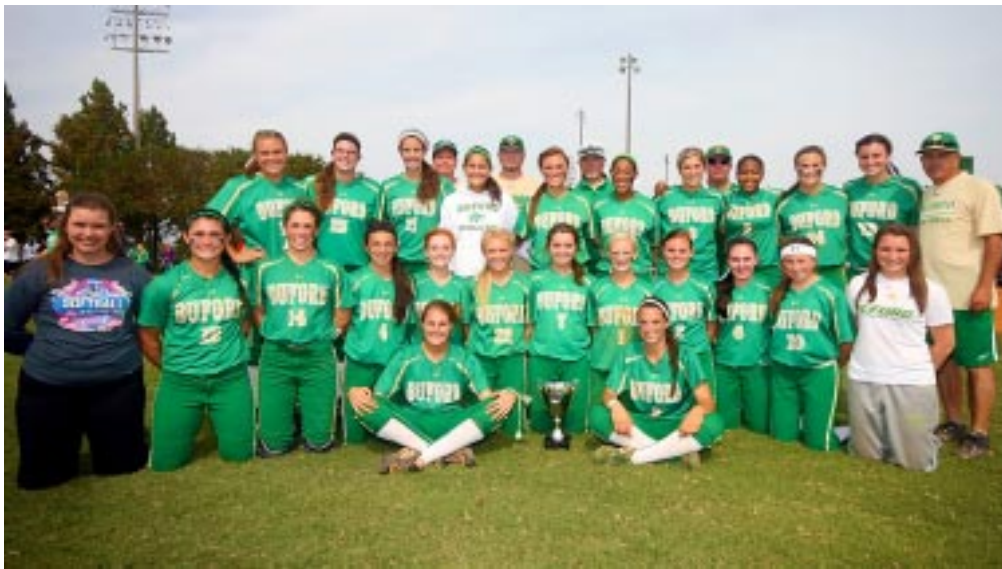
Class AAA Buford Lady Wolves