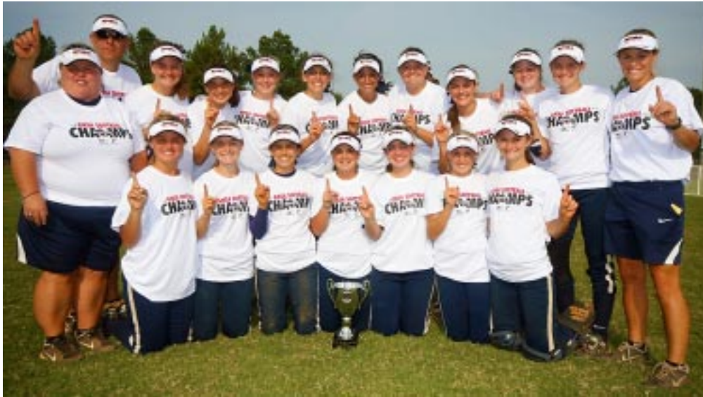
Class A Public Gordon Lee Lady Trojans