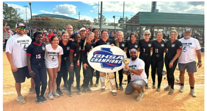
A, Division 2: Lanier County