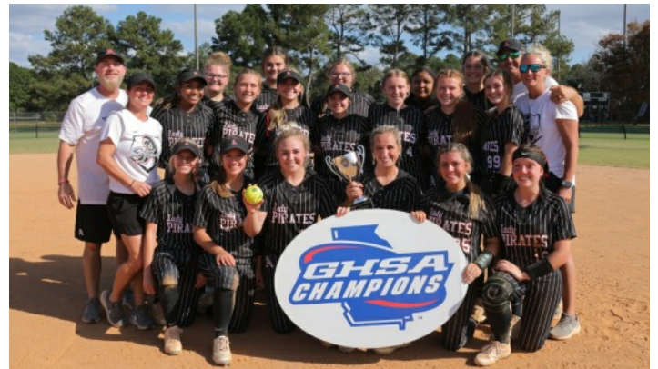
2A: Appling County