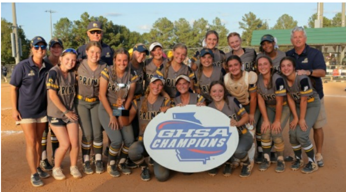
A, Division 1: Prince Avenue