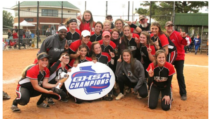
2A: Social Circle