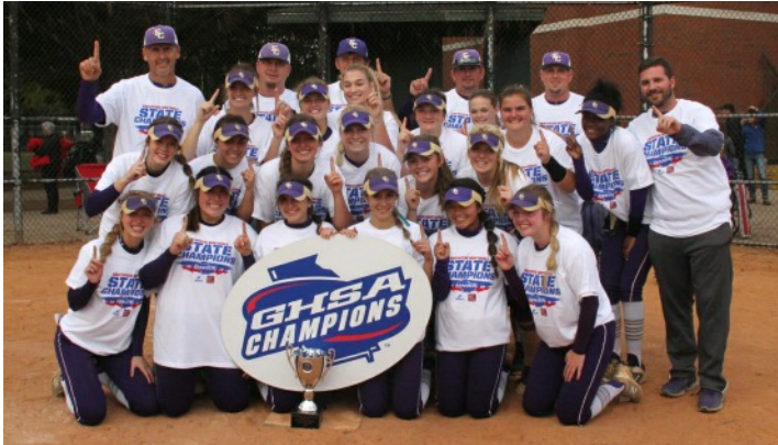
7A: East Coweta