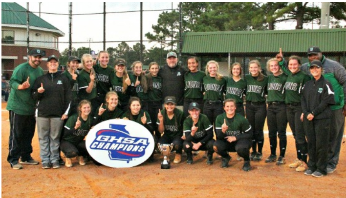
3A: Franklin County