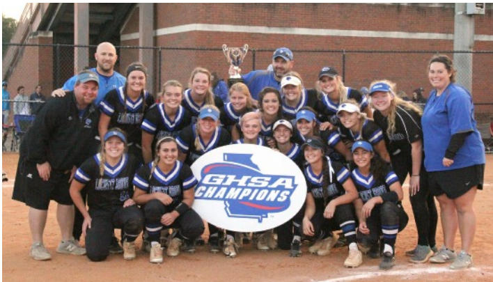
5A: Locust Grove